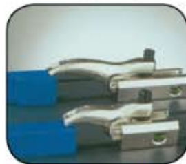
Series MQ 100