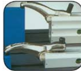
Series MQ 110/130