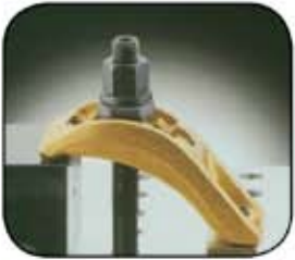
Series S 30