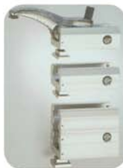
Series MQ 110/130