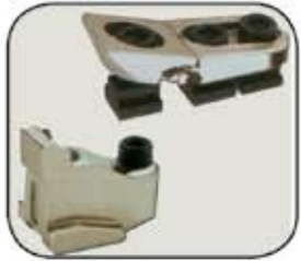
Series NU 10/FL 10

Lenzkes Clamping tools may be requested free of charge for a trial basis without obligation to purchase. An ideal offer for the practitioner.