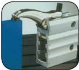
Series MQ 110/130