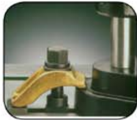
Series S 20