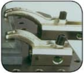
Series MQ 70