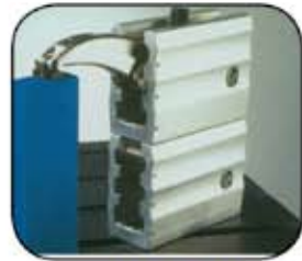
Series MQ 130