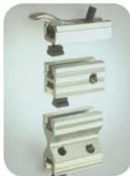
Series MQ 60/B50

Lenzkes Clamping tools may be requested free of charge for a trial basis without obligation to purchase. An ideal offer for the practitioner.