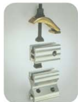
Series S 30/B 50