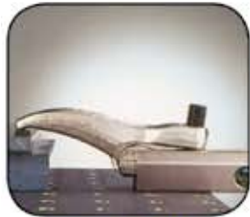
Series MQ 100

With over 25 years experience and over 80,000 satisfied customers worldwide, Lenzkes is renowned for its high quality work-holding solutions