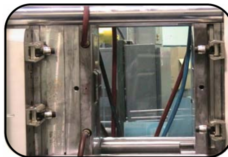
Series MQ 100