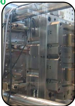
Series MQ 100