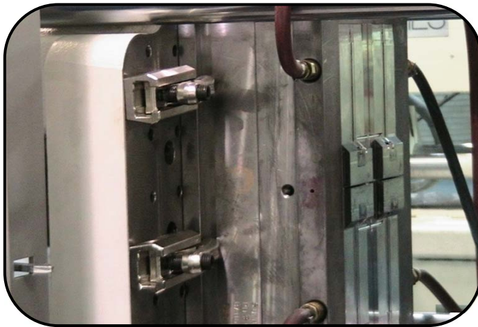
Series MQ 100

✪ Also our one piece Multi Quick clamp will save the platen and tapped holes on your machines