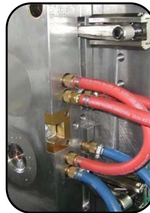
Series MQ 104